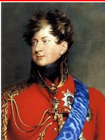
Prince Regent (1811) King George IV (1820)