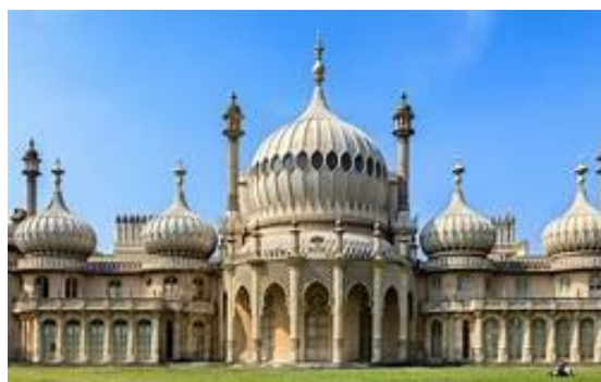
The Brighton Pavilion (built in 1787)