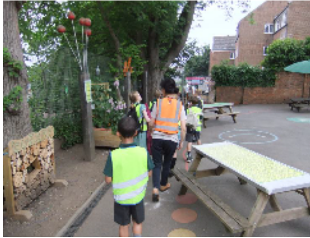
The children on their daily walk from Breakfast Club to Stanford Junior School.