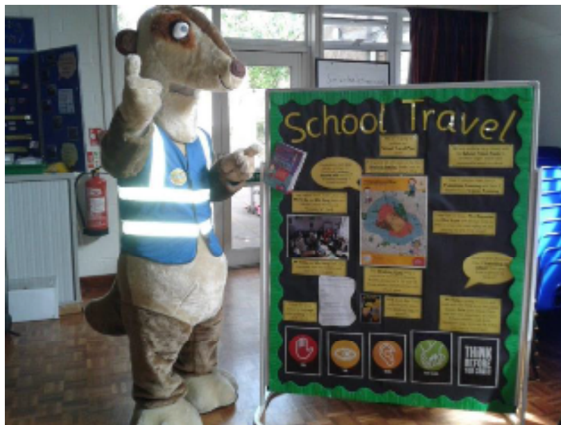
The Brighton and Hove School Travel mascot, Piers the Meercat, visiting our school to celebrate 'Walk to School Week'. He was very impressed with our School Travel display, celebrating all safe and sustainable travel.